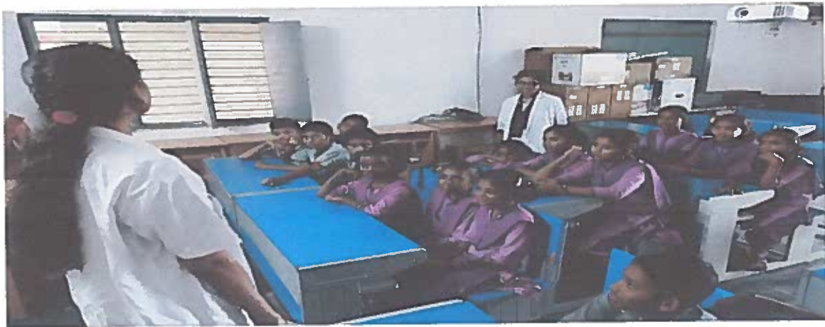
Event pic-2: NSS volunteers educating the students on importance and need for education