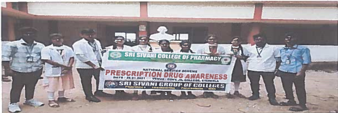
Event pic-1: Event on prescription drug awareness conducted at Government junior college