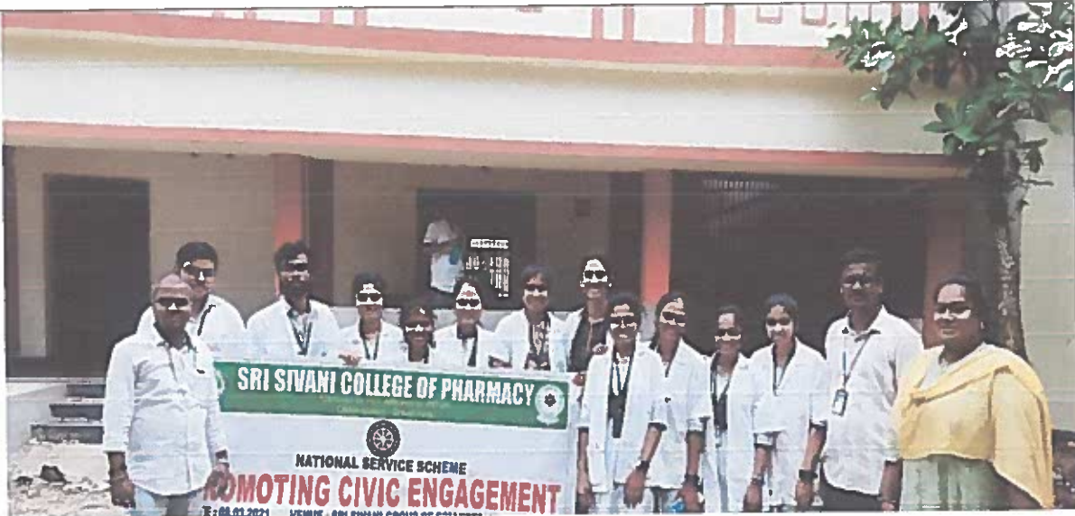
Event pic-1: Promoting civic engagement conducted at government junior college