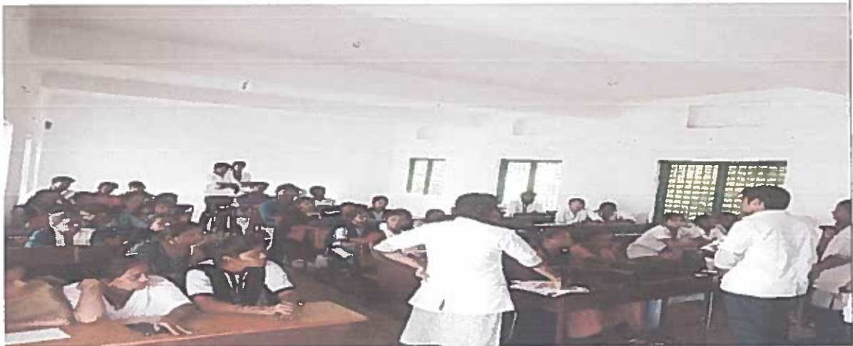
Event pic-2: NSS volunteers educating the students regarding safe use of medicines and to prevent usage of alcohol, tobacco and drugs