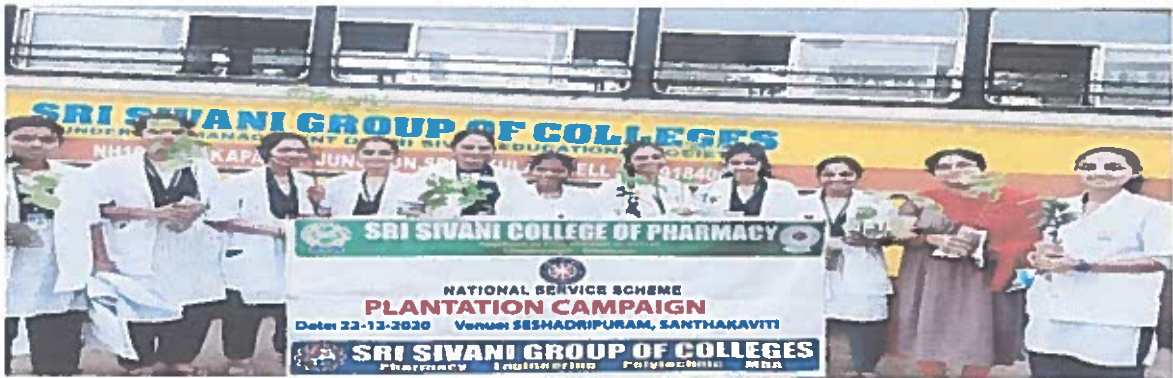
Event pic – 1: Event on plantation conducted at seshadripuram village