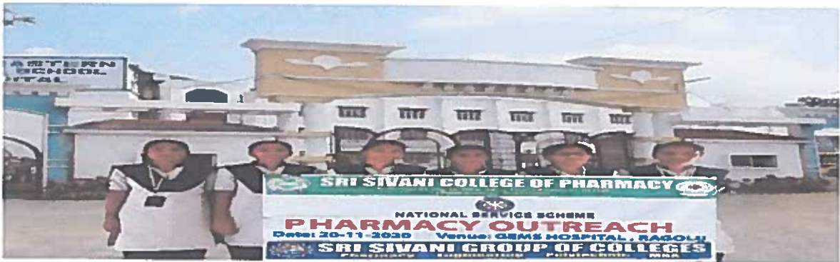
Event pic-1: An event on pharmacy outreach conducted at GEMS hospital