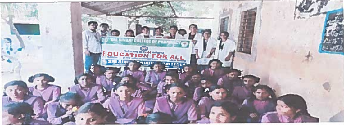
Event pic-1: Event on education for all conducted at government high school