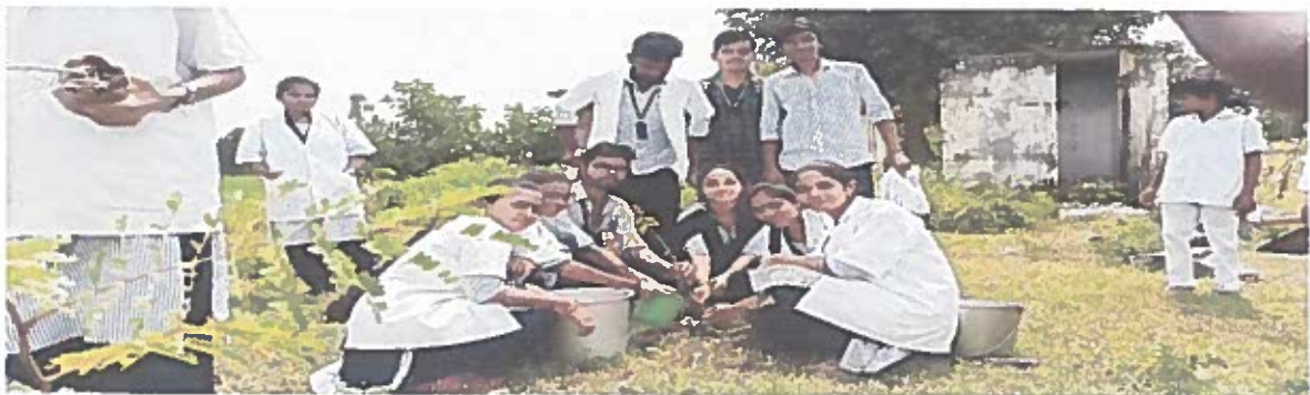
Event pic-2: NSS volunteers along with students involved in planting the saplings