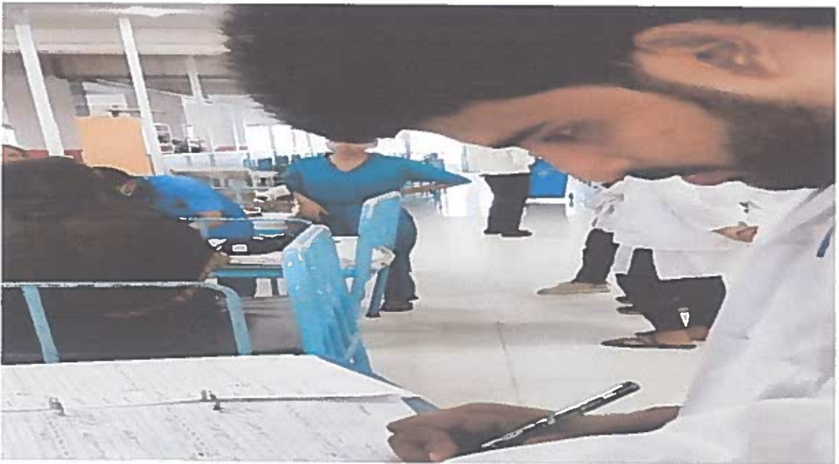
Event pic-2: NSS PO and NSS volunteers involved in the event by educating on unintended drug consequences