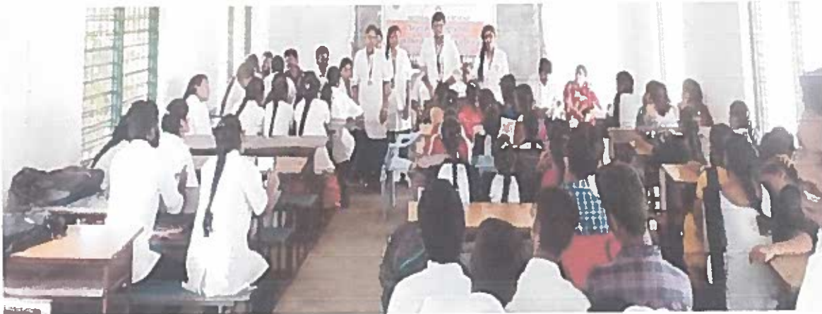
Event pic-2: NSS volunteers educating the students on how to lead the quality life