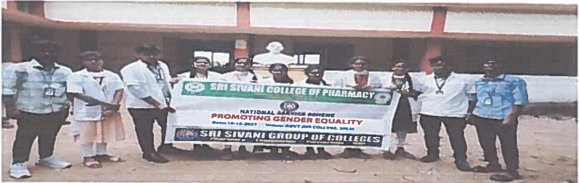
Event pic-1: Event on promoting gender equality conducted at Government junior college