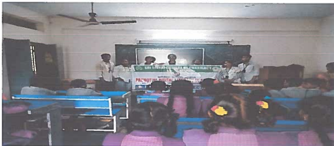
Event pic-2: NSS volunteers along with NSS PO educating the students regarding benefits of digital platform sources