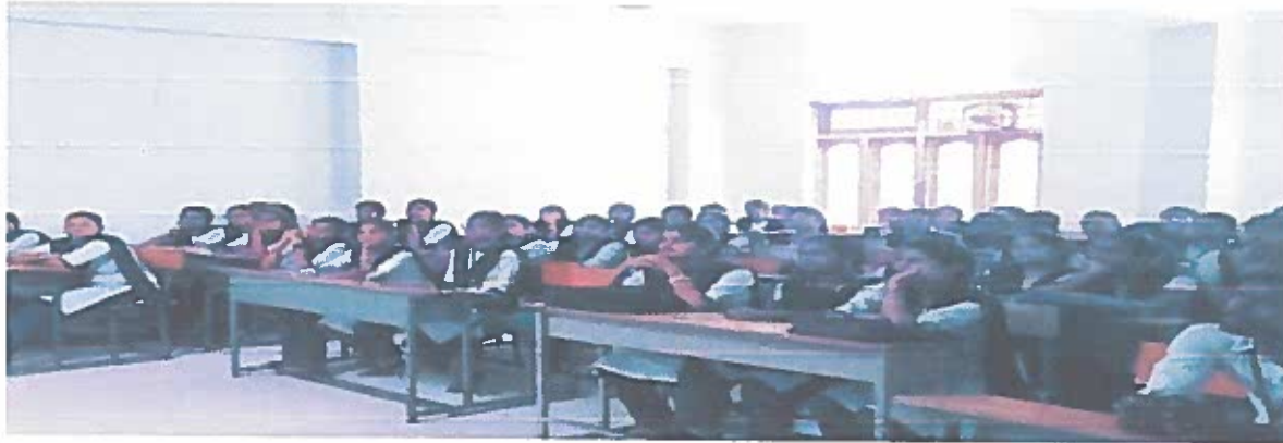
Event pic-2: NSS volunteers educating the students on promoting social inclusivity