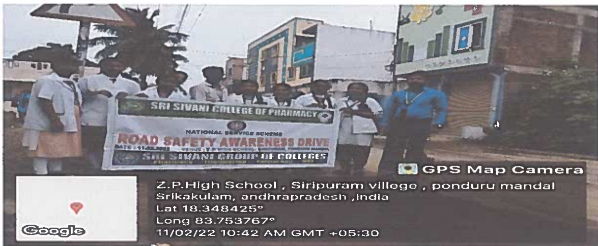
Event pic-1: Road safety awareness drive conducted at ZPHS