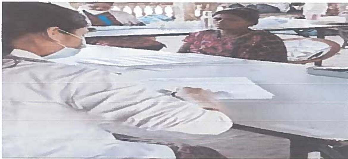
Event pic-2: NSS volunteers along with NSS PO Educating the residents of the village regarding financial literacy and implementing these principles for a brighter future