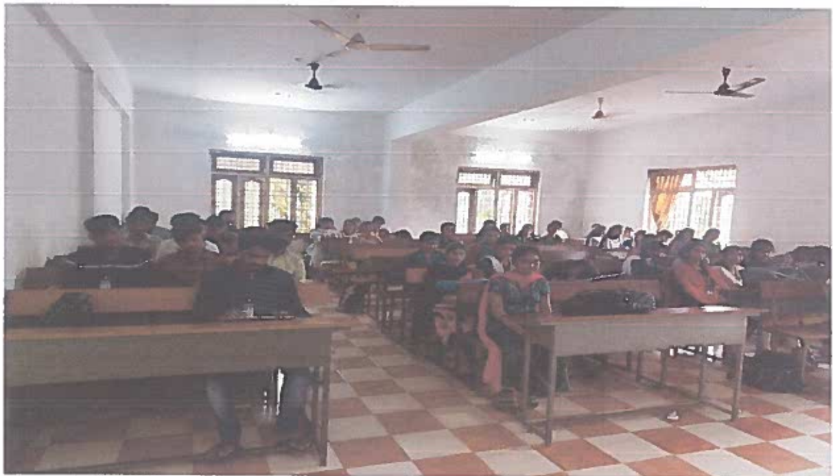
Event pic-2: NSS volunteers along with NSS PO educating the students regarding the inequalities persistent in women and men to promote equality