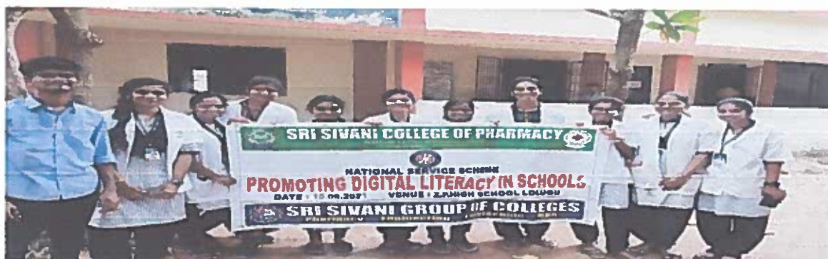
Event pic-1: Event on Promoting digital literacy in schools conducted at ZP high school