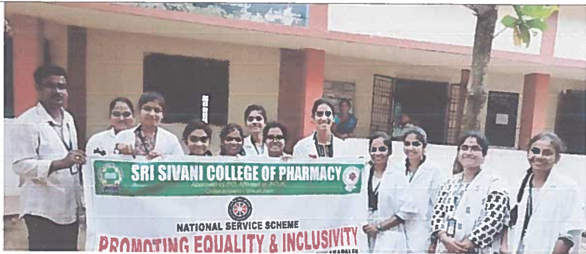
Event pic-1: Event on promoting equality and inclusivity at Govt. junior college, Etcherla