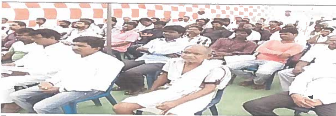
Event pic-2: NSS Volunteers educating the residents of narsapuram villege on sustainable practices of Agriculture