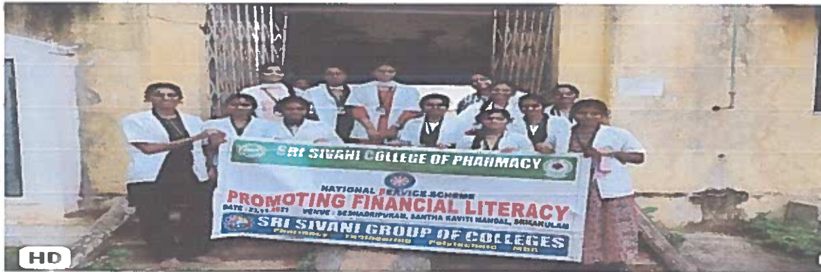
Event pic -1: Event on promoting financial literacy conducted at Seshadripuram village