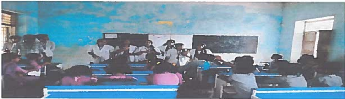
Event pic-2: NSS volunteers educating children on road safety