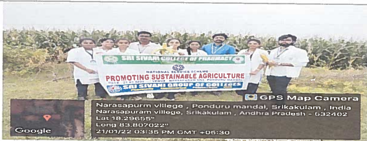
Event pic-1: NSS volunteers conducted an event on promoting sustainable agriculture at Narsapuram villege